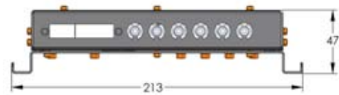
Figure 1. Dimensions (mm) back view